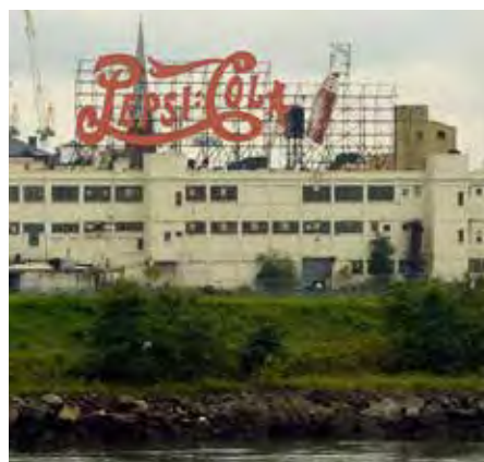
The Pepsi Cola sign was originally located atop the PepsiCo bottling plant in Long Island City. The plant closed in 1999 and was demolished in 2001 to make way for a luxury condo tower.

The Depression-era neon sign was once perched atop PepsiCo's Long Island City bottling plant. The plant was demolished in 2001, but the beloved 60-foot sign survived and finally achieved formal landmark status this year. An icon of the Queens waterfront, the Pepsi Cola sign is one of the last vestiges of an era when industrial factories churned out popular products made in NYC.