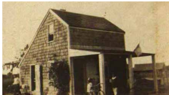
(Left) An old photo of the George Fowler house found in the East Hampton Library's Long Island Collection archives, reveals that the house's existing gabled roof porch replaced an earlier porch with a flat shed roof. Although vernacular in style, the gabled roof porch is reminiscent of Greek revival architecture that was popular in East Hampton around the mid-19th century.