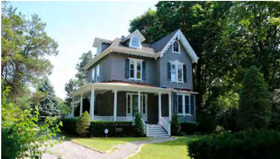
The historic house that once stood at 104 Sixth Street (above) was built in 1883 and listed on the National Register of Historic Places in the late 1970s as part of the A. T. Stewart-era Thematic Group.

The house that stood at 104 Sixth Street in Garden City for over 130 years fell prey to the steel claw of a Caterpillar excavator on August 1st. Built in 1883, this structure was part of the visionary planned community developed by Alexander T. Stewart upon the then grassy expanses of the Hempstead Plains.