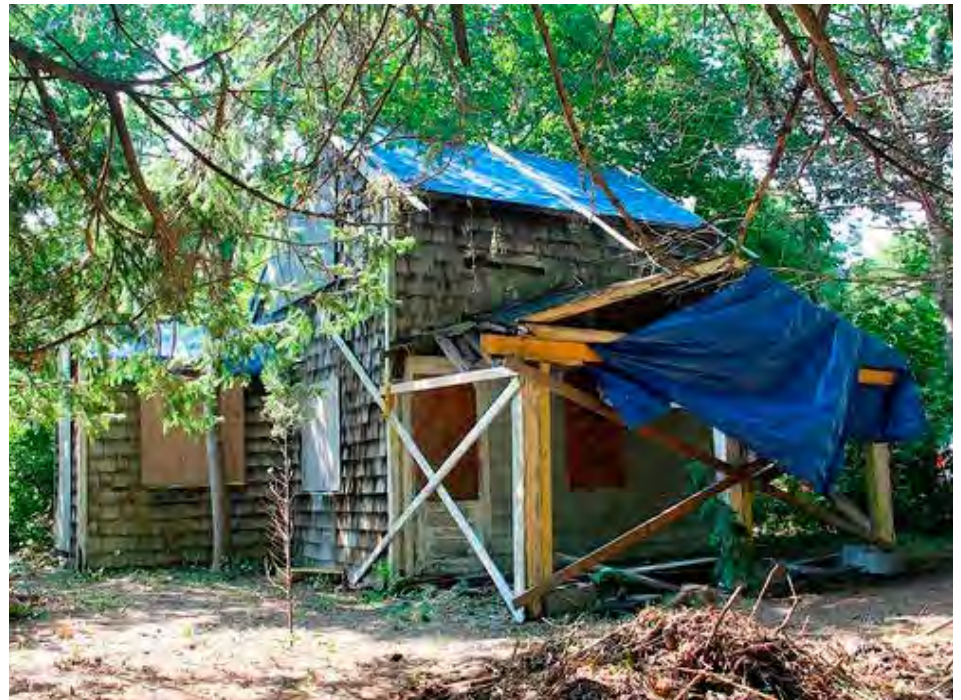
The George Fowler House will be preserved by the Town of East Hampton as a place for remembrance and acknowledgement of Native American life on Long Island from the distant past to today.