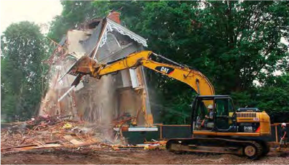
The A.T. Stewart-era house at 104 Sixth Street, Garden City, was demolished on August 1, 2016.