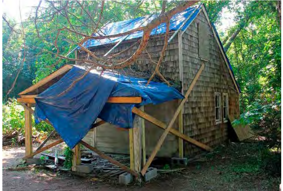
George Fowler's house was moved from Montaukett land at Indian Fields (now Montauk County Park) to Freetown, East Hampton, in the 1880s. Now owned by the Town of East Hampton, this extraordinary house is in dire need of repair.

The Fowler family occupied the house in Freetown from roughly 1885 through the end of the 20th century. A 1½ story saltbox structure, the house measures roughly 15x15 feet, with a small later addition to the side. It stands on field stone corners, but does not appear to have a full fieldstone foundation or basement. There was a kitchen, living room, and bedroom downstairs. Upstairs, there was another bedroom, a small storage area, and what appears to have been a work space under a sky light. Lacking central heating and in-