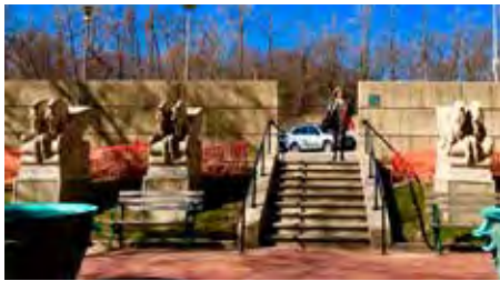
Four paired Pegasus sculptures once graced the Coney Island Pumping Station's entrances. A testament to the building's stylistic excellence, the Pegasus statues are now on display at the Brooklyn Museum's Steinberg Family Sculpture Garden.

Commissioned as a Works Progress Administration project, the Pumping Station represents the only public design by Irwin S. Chanin, who is known for his landmarked buildings in Manhattan, such as the Century and Majestic apartment buildings on Central Park West and the Chanin Building on 42nd Street.