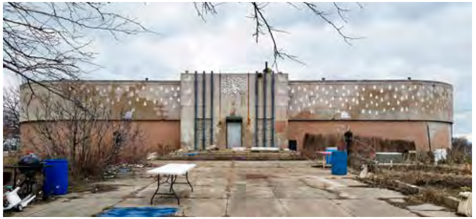
Despite years of neglect, the wide walk between lawns leading to the entrance of the curvilinear Coney Island Pumping Station still conveys Irwin S. Chanin's stately Art Moderne design. When the continuous band of three-tier windows (see below) was damaged by vandalism, the City installed painted cinder blocks to protect the building.