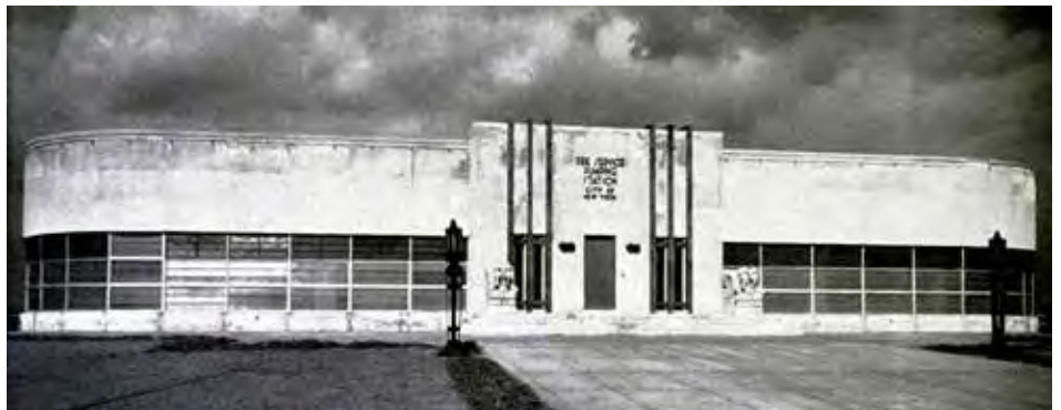
The masonry above the windows is suspended by cantilevered ends of the Pumping Station's roof girders.

Paired Art Deco Pegasus statues by the Piccirilli Brothers originally flanked the station's two entrances. The statues were loaned by the City of New York to the Brooklyn Museum in 1981 for safe keeping following an outbreak of vandalism at the site. Currently, the Pegasus are on view in the Steinberg Family Sculpture Garden at the Brooklyn Museum, where the statues have become more famous