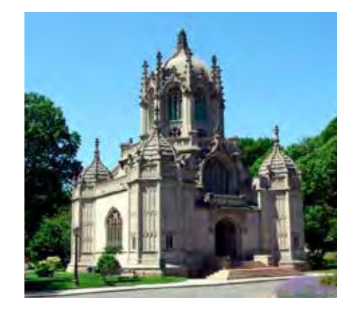
DESIGNATED Green-Wood Cemetery Chapel

500 25th Street, Brooklyn Built: 1911-13 Architect: Warren & Wetmore Backlogged since 1981 Designated on April 12, 2016