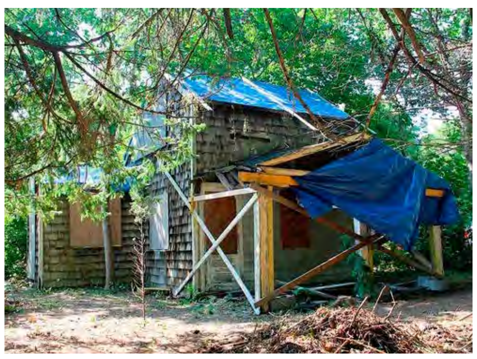
The George Fowler House will be preserved by the Town of East Hampton as a place place for remembrance and acknowledgement of Native American life on Long Island from the distant past to today.