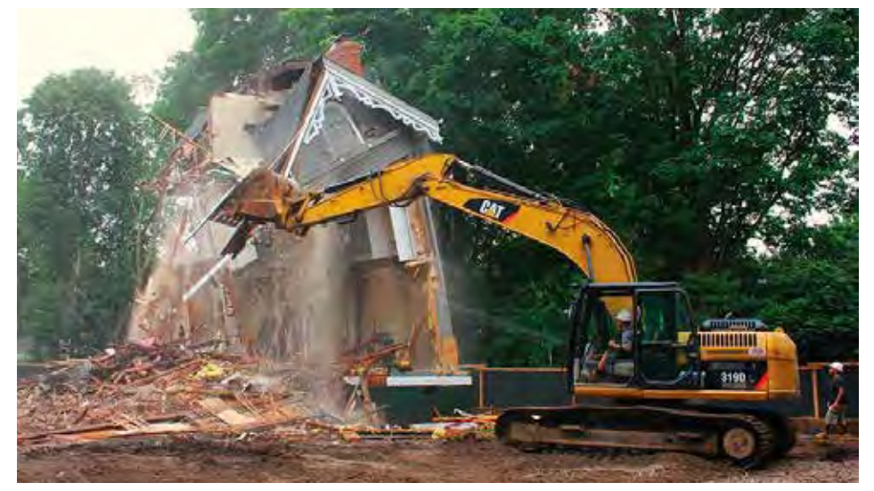
The A.T. Stewart-era house at 104 Sixth Street, Garden City, was demolished on August 1, 2016.