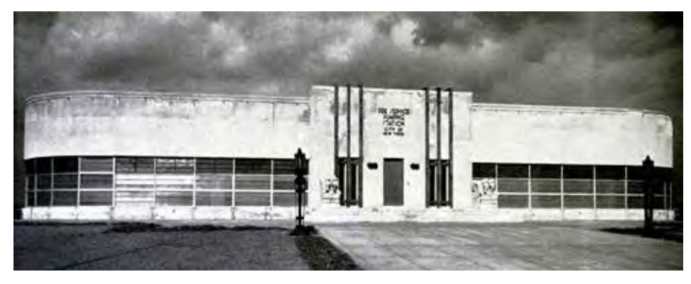
The masonry above the windows is suspended by cantilevered ends of the Pumping Station's roof girders.

Paired Art Deco Pegasus statues by the Piccirilli Brothers originally flanked the station's two entrances. The statues were loaned by the City of New York to the Brooklyn Museum in 1981 for safe keeping following an outbreak of vandalism at the site. Currently, the Pegasus are on view in the Steinberg Family Sculpture Garden at the Brooklyn Museum, where the statues have become more famous