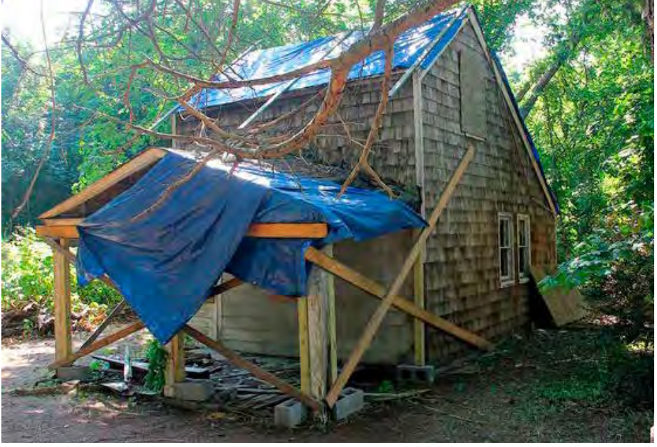
George Fowler's house was moved from Montaukett land at Indian Fields (now Montauk County Park) to Freetown, East Hampton, in the 1880s. Now owned by the Town of East Hampton, this extraordinary house is in dire need of repair.

The Fowler family occupied the house in Freetown from roughly 1885 through the end of the 20th century. A 1\frac{1}{2} story saltbox structure, the house measures roughly 15x15 feet, with a small later addition to the side. It stands on field stone corners, but does not appear to have a full fieldstone foundation or basement. There was a kitchen, living room, and bedroom downstairs. Upstairs, there was another bedroom, a small storage area, and what appears to have been a work space under a sky light. Lacking central heating and in-