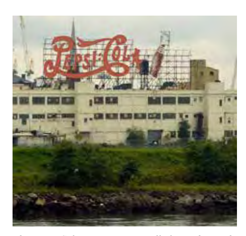
The Pepsi Cola sign was originally located atop the PepsiCo bottling plant in Long Island City. The plant closed in 1999 and was demolished in 2001 to make way for a luxury condo tower.

The Depression-era neon sign was once perched atop PepsiCo's Long Island City bottling plant. The plant was demolished in 2001, but the beloved 60-foot sign survived and finally achieved formal landmark status this year. An icon of the Queens waterfront, the Pepsi Cola sign is one of the last vestiges of an era when industrial factories churned out popular products made in NYC.