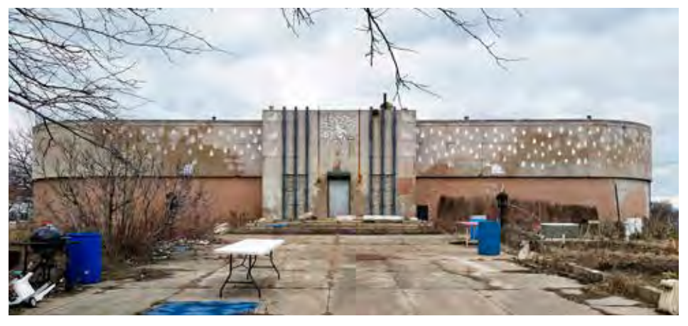
Despite years of neglect, the wide walk between lawns leading to the entrance of the curvilinear Coney Island Pumping Station still conveys Irwin S. Chanin's stately Art Moderne design. When the continuous band of three-tier windows (see below) was damaged by vandalism, the City installed painted cinder blocks to protect the building.