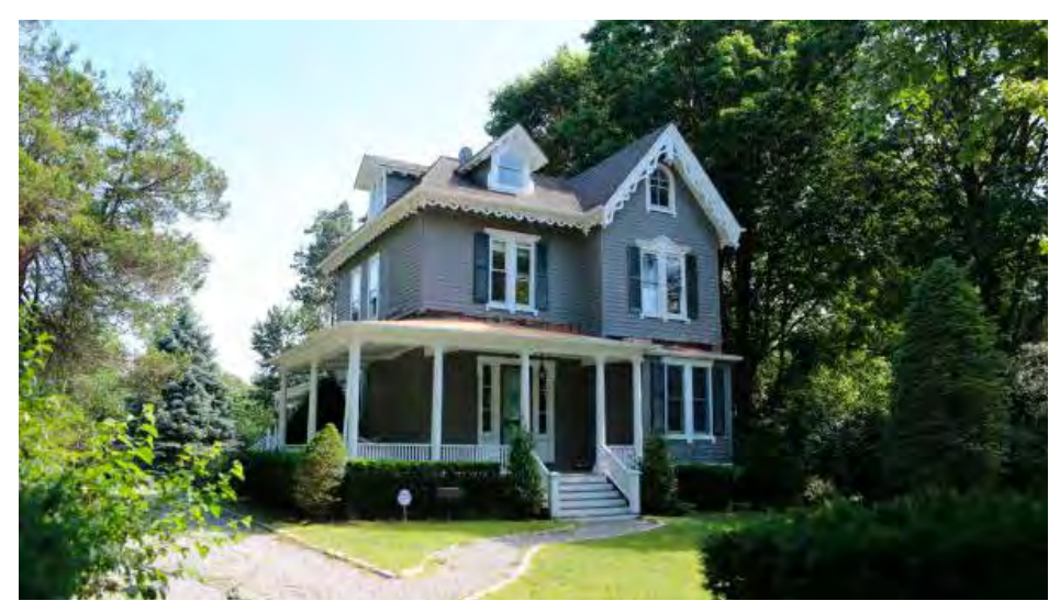
The historic house that once stood at 104 Sixth Street (above) was built in 1883 and listed on the National Register of Historic Places in the late 1970s as part of the A. T. Stewart-era Thematic Group.

The house that stood at 104 Sixth Street in Garden City for over 130 years fell prey to the steel claw of a Caterpillar excavator on August 1st. Built in 1883, this structure was part of the visionary planned community developed by Alexander T. Stewart upon the then grassy expanses of the Hempstead Plains.