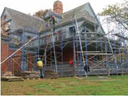
Sagamore Hill under construction, 2013.

If you've ever visited a historic house museum on a hot summer day, you've experienced it: That nagging curiosity about how people managed to endure the heat with little more than an open window. Outfitting historic houses with modern heating and cooling systems has always been a conundrum, especially if the intention is to maintain an immersive