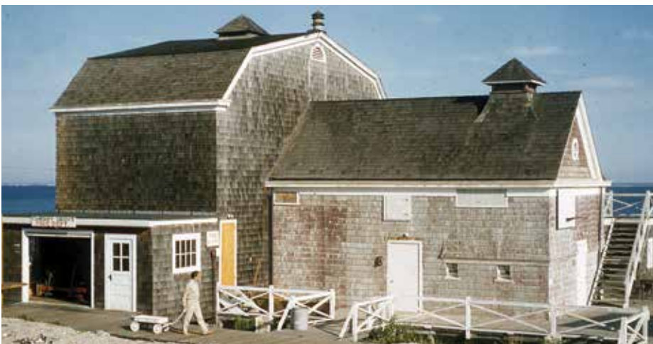
The c. 1900 Cherry Grove Community House with 1949 gambrel roof theater addition at left, 2012.

Located in Brookhaven's Fire Island hamlet of Cherry Grove, the Community House and Theater is the third site in America to be listed on the National Register of Historic Places for playing an important role in the history of the gay liberation movement.