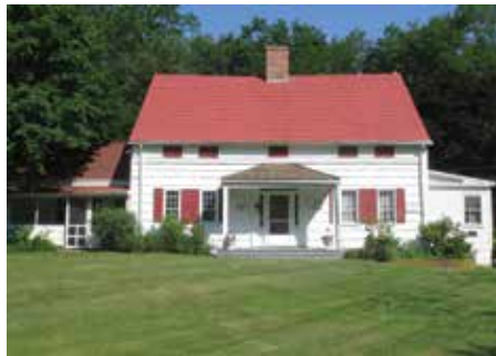
The main facade of Noah Hallock Homestead, 2012.

The first step was to contact the owner to make a case for the site's importance and to ask for some time to raise funds for the purchase. The owner agreed and even reduced the asking price from $282,000 to $200,000. A no-interest mortgage loan was secured from a generous benefactor, and the down payment was produced by donations from various supporters and a