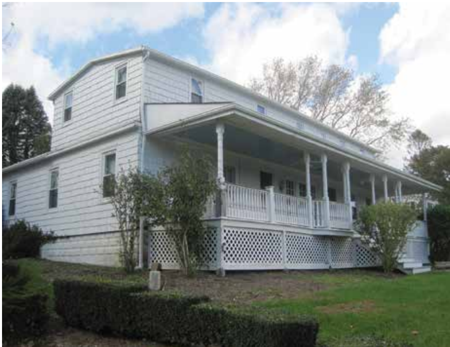
View of the Pyrrhus Concker Homestead today with early twentieth century alterations, 2013.