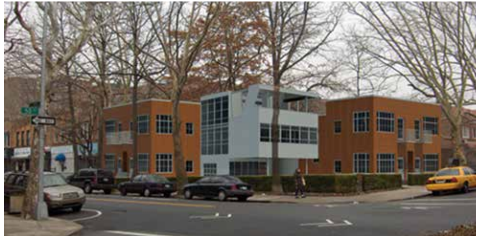
Architect's rendering of the Aluminaire House as the anchor of a new residential housing development in Sunnyside, Queens, 2013. (Courtesy of Campani & Schwarting Architects.)

In 1987 the Aluminaire House was described as one of the "...pivotal works of modern architecture in America" by Paul Goldberger, then the architecture critic for the New York Times. Originally created for display in the 1931 Architectural and Allied Arts Exhibition in New York, it was designed by architects Albert Frey and A. Lawrence Kocher as a model for affordable manufactured housing made out of aluminum, steel and glass. The house later appeared at the Museum of Modern Art's famous 1932 show "The International Style: Architecture Since 1922" which