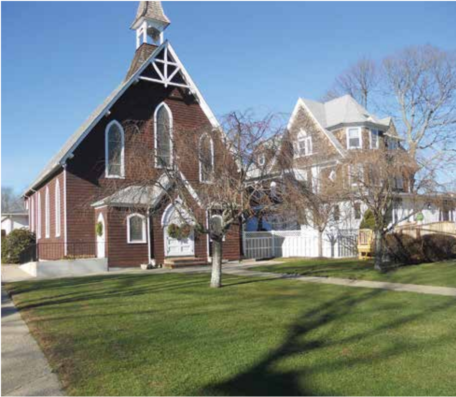
View of the Sacred Heart Church and Rectory, 2013.

On the North Fork, another religious property on SPLIA's 2013 endangered list is turning towards a more optimistic future. While similar to Inisfada in being perceived by its owner as a no longer needed redundant facility, the Sacred Heart Church complex has a chance of being saved because stakeholders have agreed to discuss preservation planning.