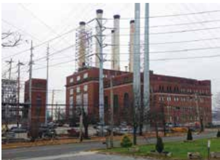
View of the Glenwood Power Plant today, 2013.

Just up the Hudson River in Yonkers, there's a Glenwood Power Station that's the center of a 250 million dollar redevelopment plan slated to open in 2016. Incorporating a program for hotel, spa, restaurant, retail, and event uses, Senator Charles Schumer has called it a high priority that is estimated to employ 2,000 construction workers and generate 1,000 permanent jobs after completion. A compelling promotional video on YouTube summarizes the project in less than two minutes. Called "Glenwood Power Plant Project," it can easily be imagined for our very own power plant on Long Island... if only the right people could see the light.