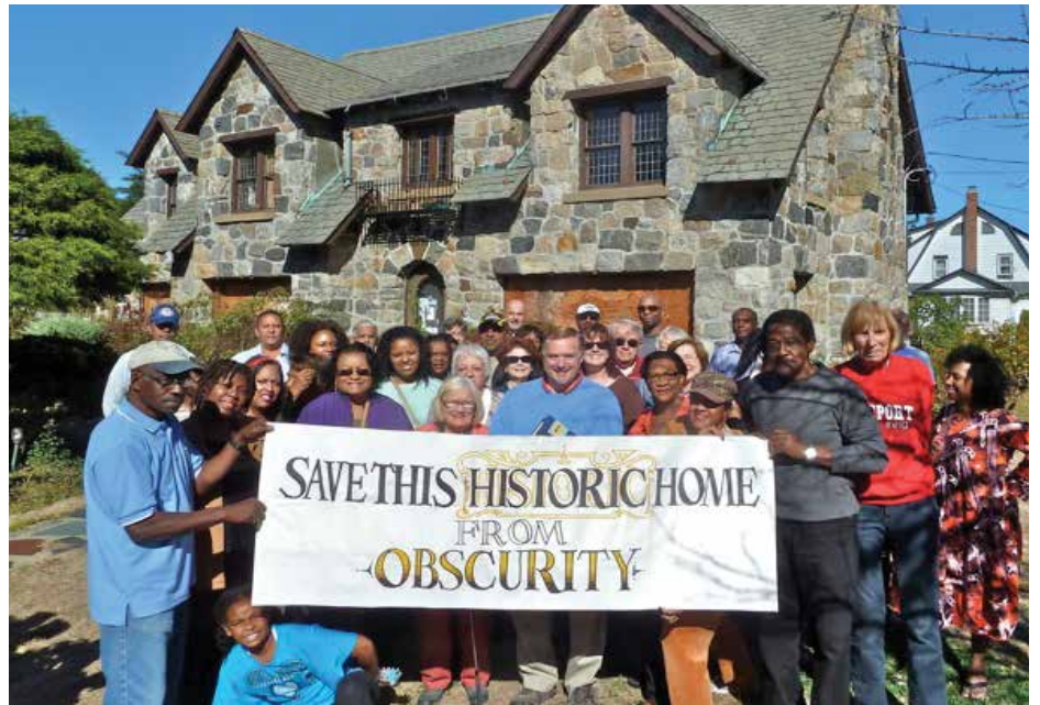
Advocates gather at the Jacob Post House in support of local landmark designation, 2013.

brought the building's storied past to life. Encouraged, Village Trustees approved designation in October. Such status won't prohibit an owner from making changes, but it will prevent demolition and require future alterations to be appropriately tuned to the historic qualities that made the property a community asset in the first place.