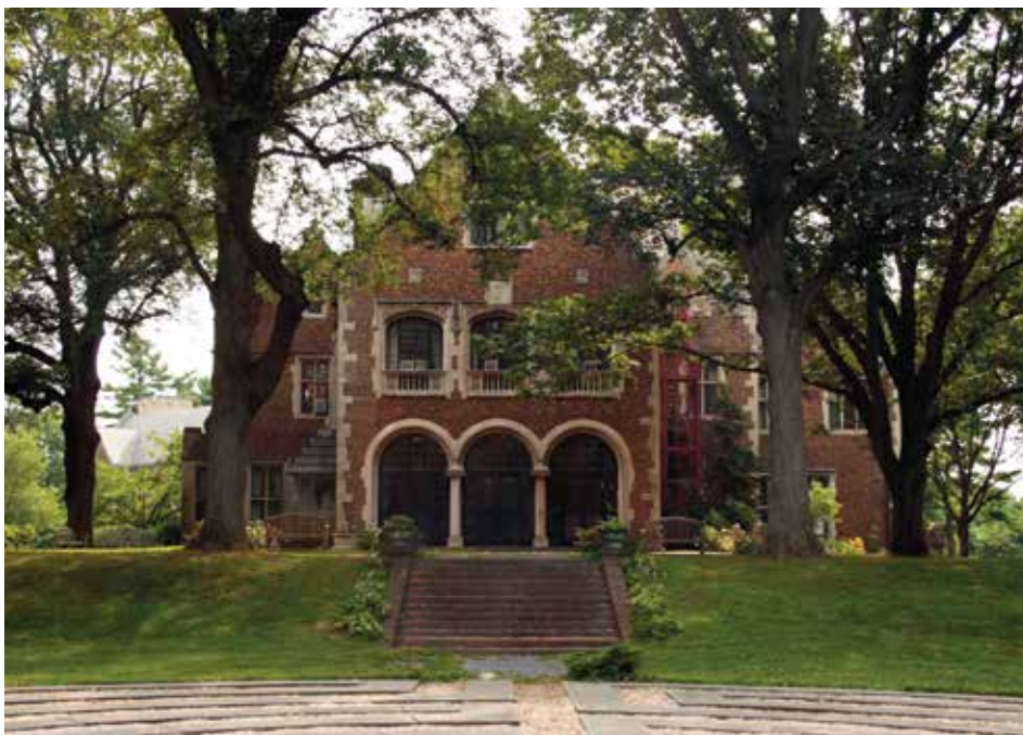
One last view of the Jesuit Retreat House at Inisfada with mature landscape, 2013.

Once again, SPLIA's latest list of endangered historic places spans over 200 years of Long Island history. From a classic eighteenth century farmhouse with commercial additions threatened by demolition, to a 1929 high-rise bank building that's been vacant for over 20 years, each nomination reveals how the built environment absorbs collective stories over time. Six nominated sites officially made the list, but it was SPLIA's watch property, the St. Ignatius Retreat House at Inisfada, that garnered most of the attention. Unfortunately, such attention came too late and Inisfada is now the first property associated with our endangered list to be lost.